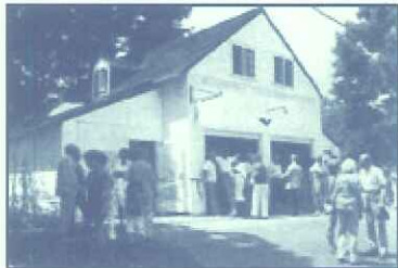
Platt Nature Center

For more information on the Killingworth Reservoir Hiking Trail please call Connecticut Water at 1-800-286-5700.